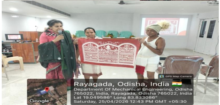
Rayagada, Odisha, India Department Of Mechanical Engineering, Odisha 765022, India, Rayagada, Odisha 765022, India Lat 19.049586° Long 83.833086° Saturday, 25/04/2026 12:43 PM GMT +05:30