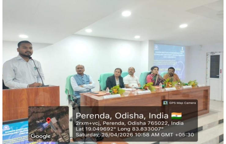
Perenda, Odisha, India 2rxm+vcj, Perenda, Odisha 765022, India Lat 19.049692° Long 83.833007° Saturday, 25/04/2026 10:58 AM GMT +05:30