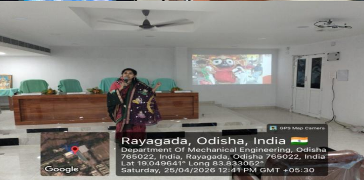
Rayagada, Odisha, India Department Of Mechanical Engineering, Odisha 765022, India, Rayagada, Odisha 765022, India Lat 19.049641° Long 83.833052° Saturday, 25/04/2026 12:41 PM GMT +05:30