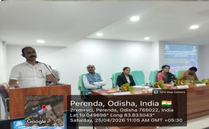
Perenda, Odisha, India 2rxm+vcj, Perenda, Odisha 765022, India Lat 19.049696° Long 83.833043° Saturday, 25/04/2026 11:05 AM GMT +05:30