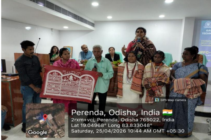
Perenda, Odisha, India 2rxm+vcj, Perenda, Odisha 765022, India Lat 19.04968° Long 83.833048° Saturday, 25/04/2026 10:44 AM GMT +05:30