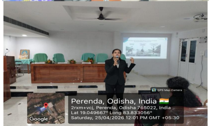
Perenda, Odisha, India 2rxm+vcj, Perenda, Odisha 765022, India Lat 19.049667° Long 83.833056° Saturday, 25/04/2026 12:01 PM GMT +05:30