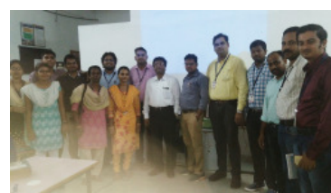
FDP ON MTM