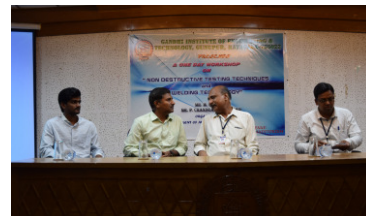
ONE DAY WORKSHOP