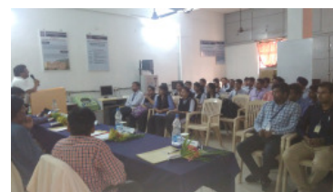
FDP ON MTM